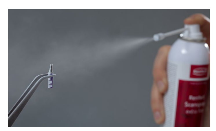
Micro-fine application for detailed scanning results