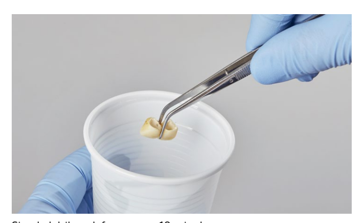
Simply let it soak for approx. 10 minutes ...