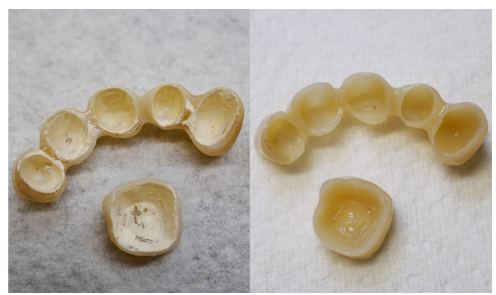
Dental restoration before and after cleaning