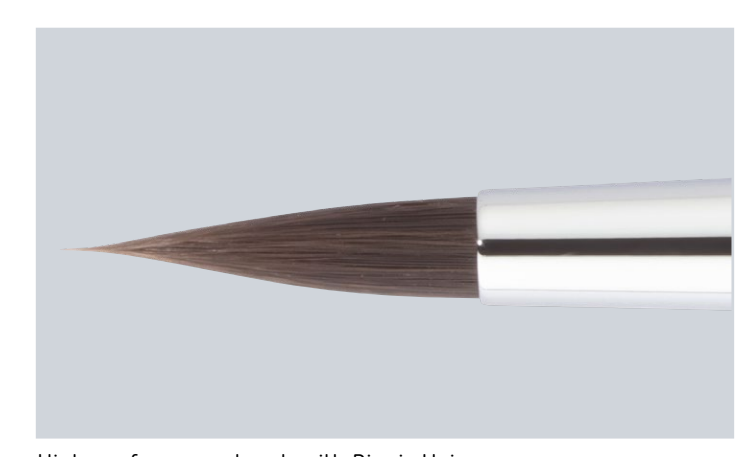
High-performance brush with Bionic Hair