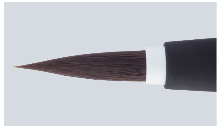
An all time classic among the ceramic brushes with Bionic Hair