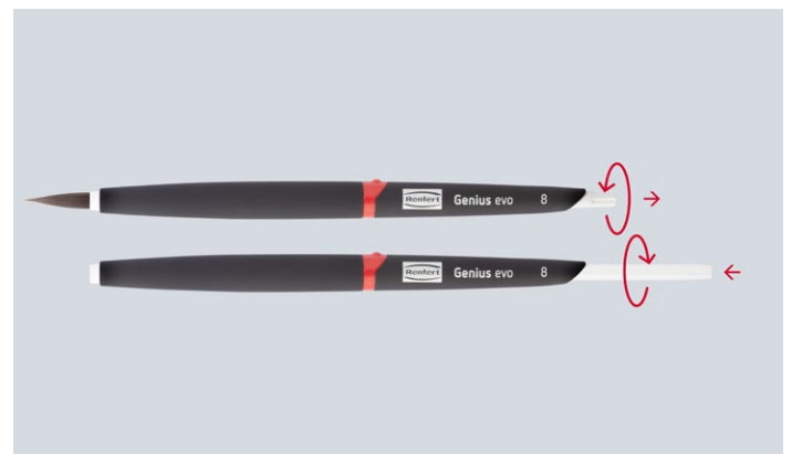
Integrated protective function thanks to rotating mechanism