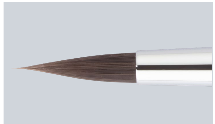
High-performance brush with Bionic Hair